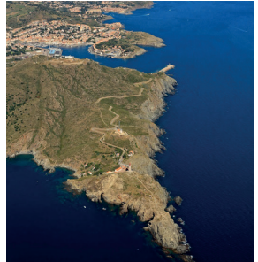
Realisation Agence Tolem